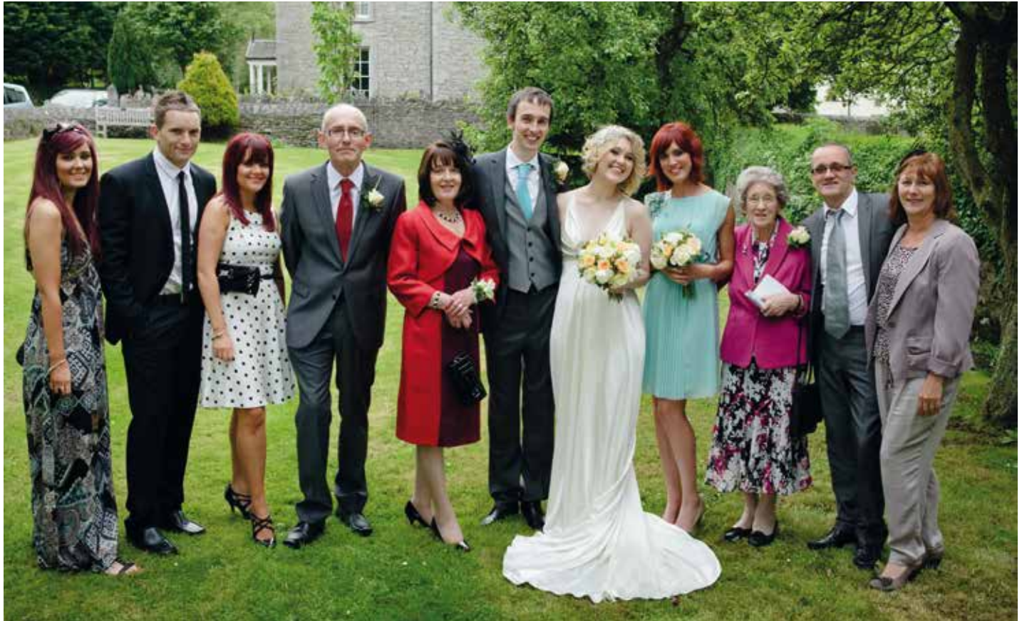
ABOVE Group shots outside can be striking and show off the beautiful venue, but make sure you've got a backup sorted in case the heavens decide to open.

copies with me; I give one to give to the usher, another to my assistant and I keep the third one for myself. It can get very difficult when the parents and grandparents are divorced, and the couple has various step/half brothers and sisters. In a situation such as this it's even more important to make a list and to be prepared. If you work it all out beforehand it will save loads of time and embarrassment on the actual day. I've covered weddings where some of the parents refuse to be in the same group as their ex-partner, for example, and I was even once asked to leave a gap between the bride's father and his new wife, so that they could crop her out of the photo later! If you know this kind of information before the big day you can shoot separate groups. It's potentially very embarrassing if you have to deal with things for the first time during the wedding.